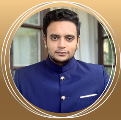
Shri Yaduveer Krishnadatta Chamaraja Wadiyar

President and Trustee - Sri Jayachamaraja Ursu Education Trust, Mysore.